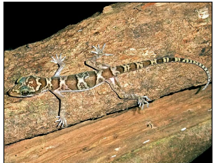
Cyrtodactylus sumonthai Bauer, Pauwels and Chanhome, 2002 – Khao Wong, Chanthaburi Province (Nonn Panitvong).

C. sumonthai has a base colour of a pale yellowish white. This is banded with pale brown markings, each of which is outlined by a darker brown border that is more prominent towards the front than the back. There is one dark band across the shoulders, two across the trunk and one across the hips. This pattern on the back fades on the gecko's flanks. The alternating pale and dark pattern of the back continues on to tail, becoming more diffuse towards the end. The eye is golden brown (Bauer et al. , 2002).