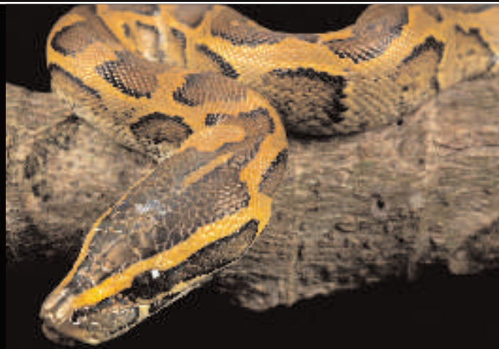
Caesar's African Water Snake ( Grayia caesar ) and right, African rock python ( Python sebae ), a non-venomous species. While not considered endangered or threatened, this species is listed as a CITES Appendix II species because their distinctive skin is used in the leather industry

now well established in Libreville, measures just under 20 centimetres. The longest is the Seba Python ( Python sebae ), which can reach up to six metres in length.